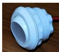
Train tail LED light 24Vdc P/N 160607001