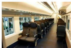
Metro ATM (Milan)