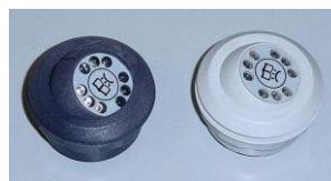
LED spots: 2W 24Vdc adjustable - P/N 31811 2W 72Vdc adjustable - P/N 3132 2W 72Vdc/ac adj. - P/N 15062201