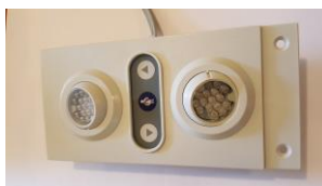
Reading ceiling for single and double seating with LED spot and touchpad P/N 151109001 double P/N 151113003 single

SAE equipment s.r.l. Electronic devices for lighting systems of railway coaches