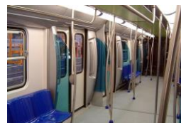
Intercity train (Italy)