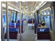
MF77 Metro (Paris)