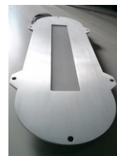
LED luminaire for gangway P/N PL16W-24V